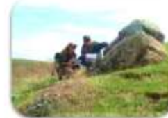
Anti-Corruption Training for Border Guards, Romanian and Ukrainian Border, Blaj, Romania