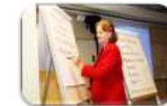
OSCE Police, Former Deputy Assistant Secretary, FBI, Teaching Women Leadership and Empowerment Skills

Through the specialized @OSCE@ Train the Trainer programme BSMU provides enhanced capacities for border guards, customs services and anti-corruption authorities of OSCE as to investigate and prosecute corruption related cases, with emphasis on cross-border related challenges.