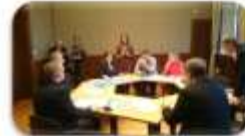
Anti-corruption interactive training for border guards, Customs Service and Anti-corruption Authorities of Moldova and Ukraine

Through establishment of OSCE Mobile Training Team to deliver training on identification and interviewing of potential FTF at the borders in the OSCE area, the Unit supports and assists OSCE participating States to better address this threat.