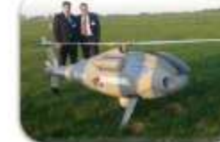
NFP meeting on "Emerging technologies in border security and management use of unmanned aerial vehicles", Opatowitz, Romania

Through use of specialized training program, OSCE Mobile Training Team delivers on-site training to BSM officials to better identify and interview potential Foreign Terrorist Fighters in full compliance with international human rights standards at entry and exit border checkpoints of OSCE area.