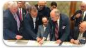
OSCE side workshops on Identification and Demarcation Practices, Bratislava, Slovakia