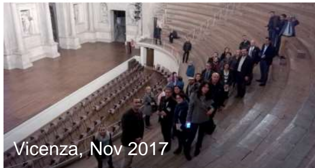
Vicenza, Nov 2017