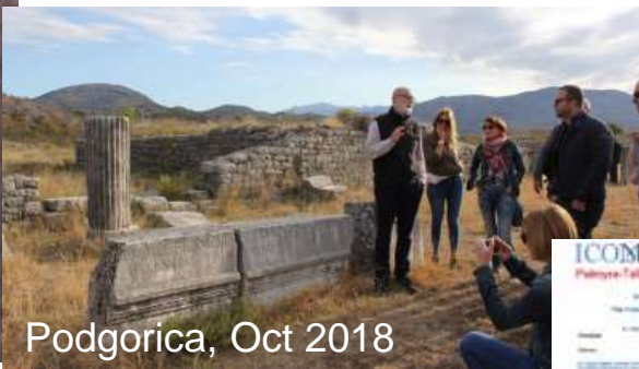
Podgorica, Oct 2018