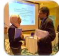
Workshop on strengthening the co-operation with Multinational partners, Salzburg, Austria