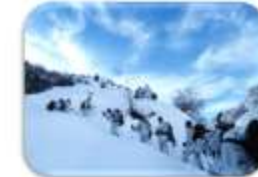
Police Programming and Exercise, Poles, OSCE Mission, Winter Training, Zakopane, Poland

BSMU brings innovation to the forefront of capacity development and training sector by introducing new teaching methodologies and integrating emerging technologies in Border Security and Management.