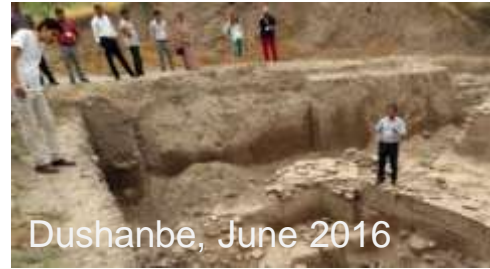
Dushanbe, June 2016