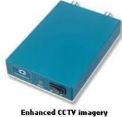
Enhanced CCTV imagery - StableEyes™

Using advanced technology and people sciences, we have also developed a reputation for leading-edge law enforcement support. Our solutions help create a safer society by enhancing physical security, profiling people, preventing counterfeiting and theft, scanning (using non-invasive technology) and training law enforcement officers in a range of skills and expertise.