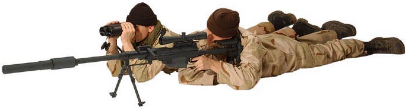
HECATE® II with optionnal sound suppressor kit